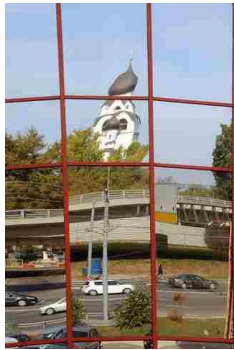
Figure 2. Distorted Image

When sharing the findings of Cycle One with participants this image was used to illustrate how participants were viewing the vision differently. Now it seems apparent that participants are looking at the system and seeing different versions of system scope. If this is happening in one area of one province it seems logical that it is happening at the national level too. When we consider the complexity of the national health care system, with multiple provinces and health care systems, we can imagine that the picture below would be much more fractured.